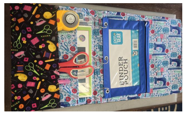
Sewing Organizer and a Bucket Hat plus a patchwork bag.

As the summer approaches, now is a good time to plan for one of our Summer Sew Camps!